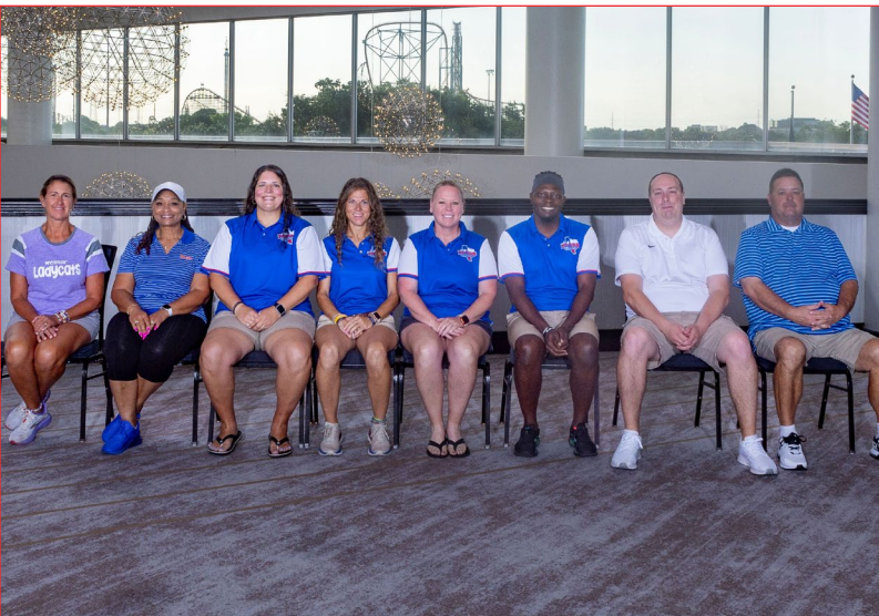
2024-25 TGCA Track & Field Committee