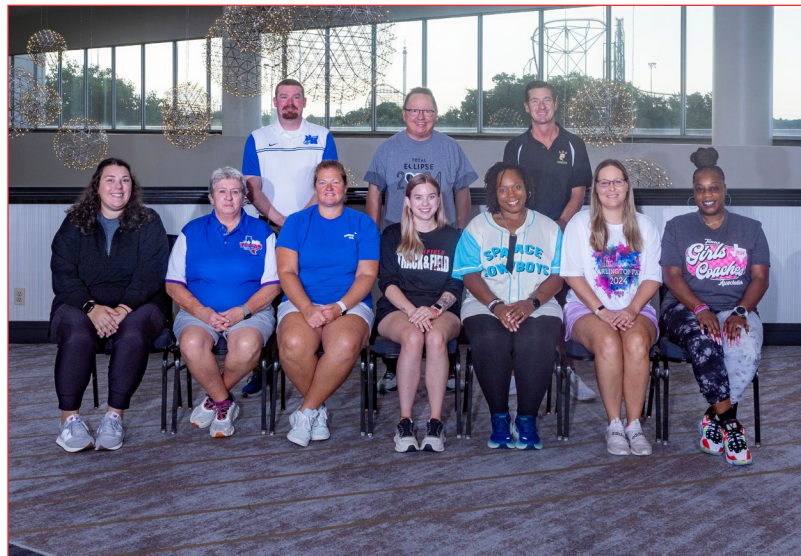
2024-25 TGCA Sub-Varsity Committee