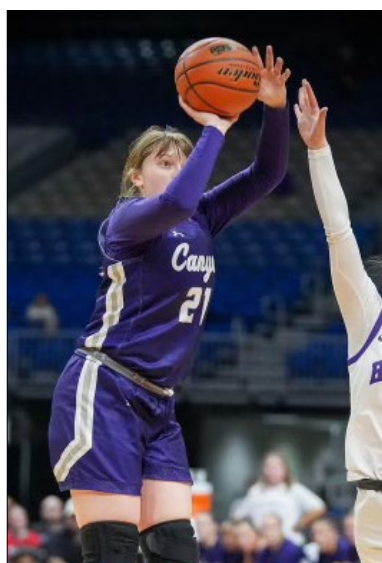
Jaylee Moss