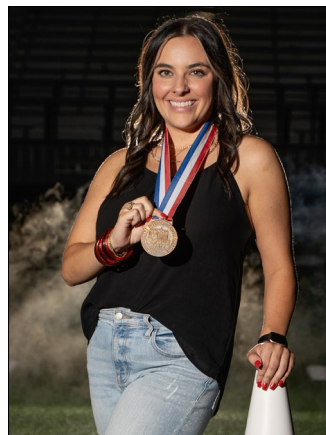
Jayci Willer