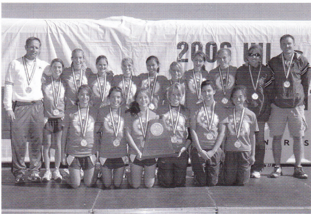
Conference 5A girls state champion Southlake Carroll cross country team