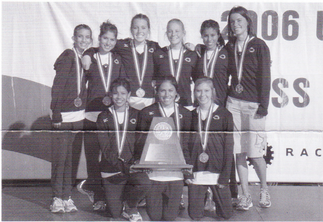
Conference 3A girls state champion Canyon cross country team