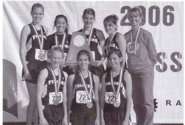
Conference 2A girls state champion Shallowater cross country team