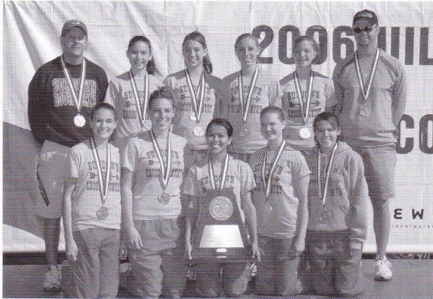
Conference 1A girls state champion Sundown cross country team