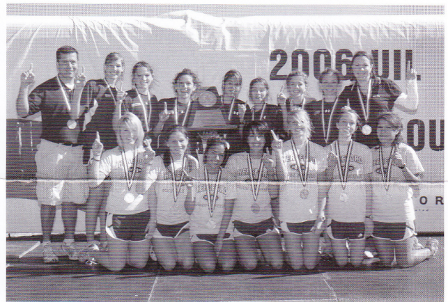
Conference 4A girls state champion Hereford cross country team